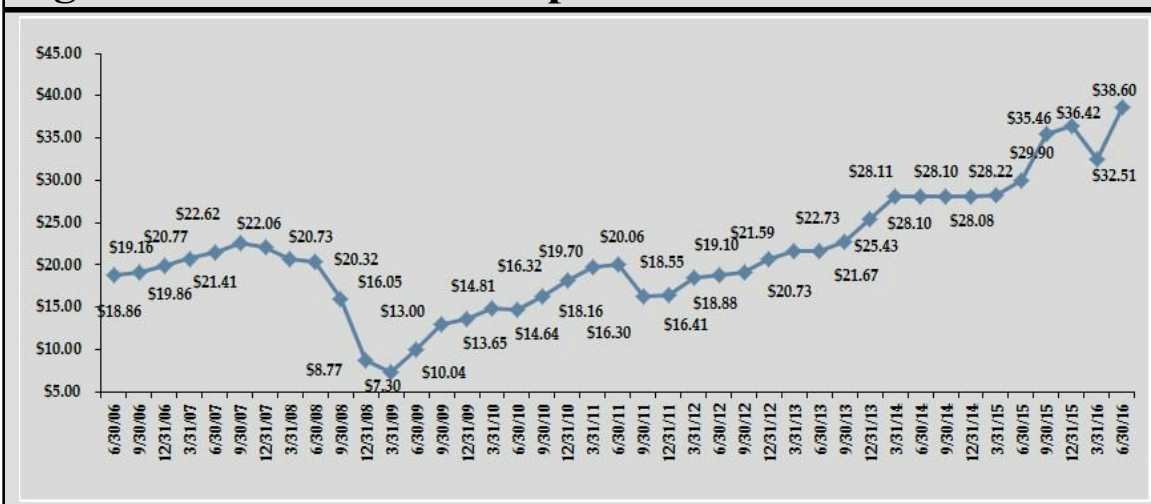
Figure 1: Net Asset Value per Unit

As of June 30, 2016, the net asset value of AP Alternative Assets was approximately $2,946.5 million, or $38.60 per common unit. This reflects a net increase in net assets after contributions, distributions and unit purchases of approximately $166.7 million, or $2.18 per common unit during the six months ended June 30, 2016.