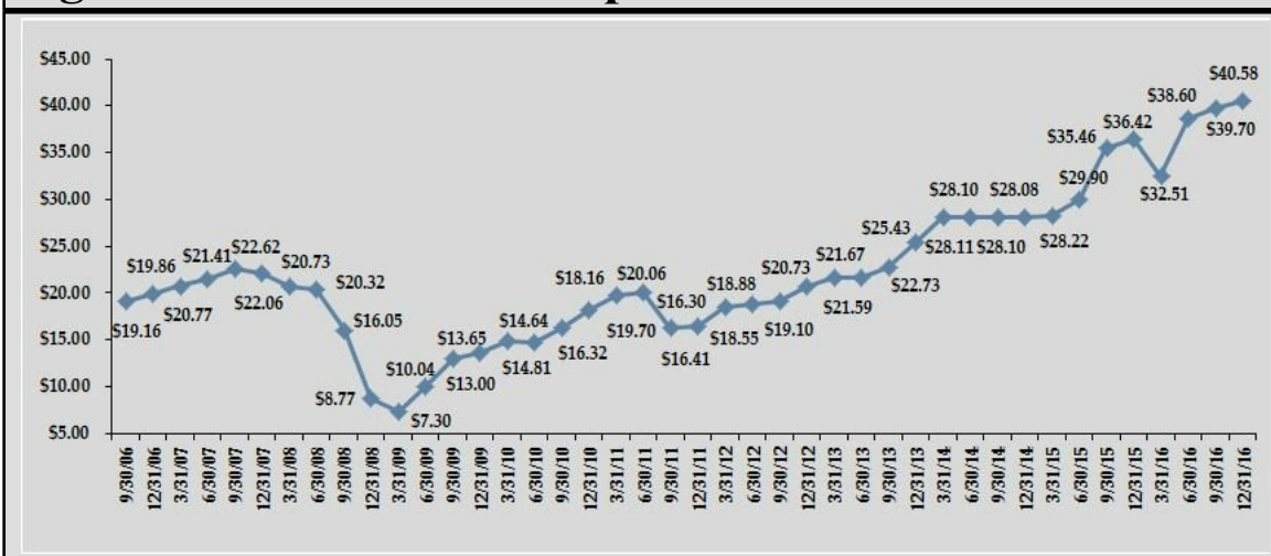
Figure 1: Net Asset Value per Unit

As of December 31, 2016, the net asset value of AP Alternative Assets was approximately $3,097.6 million, or $40.58 per common unit. This reflects a net increase in net assets after contributions, distributions and unit purchases of approximately $317.8 million, or $4.16 per common unit during the year ended December 31, 2016.