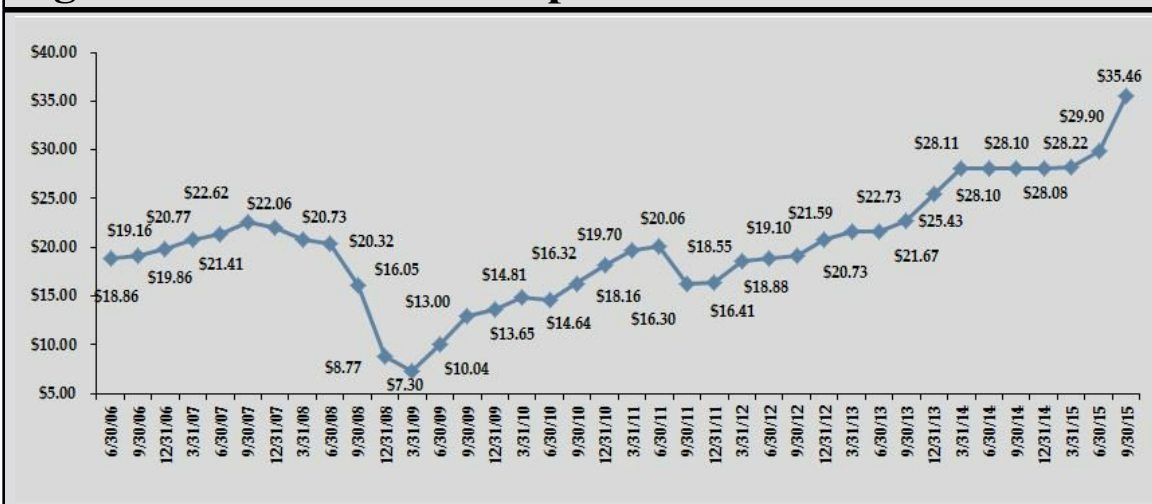
Figure 1: Net Asset Value per Unit

As of September 30, 2015, the net asset value of AP Alternative Assets was approximately $2,706.9 million, or $35.46 per common unit. This reflects a net increase in net assets after contributions, distributions and unit purchases of approximately $563.4 million, or $7.38 per common unit during the nine months ended September 30, 2015.